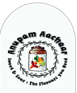
Anupam Pickles Founder - Ankush