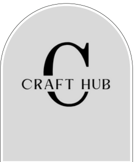
Craft Hub Founder - Dimpal