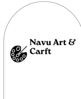
Navu Art & Craft Founder-Navneet