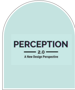
Perception 2.0 Founder - Vandhana